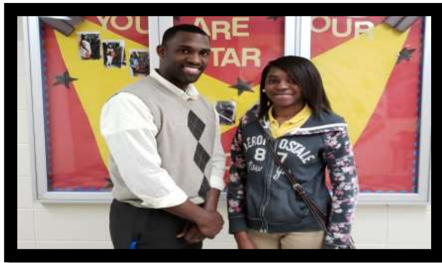
Exceptional Students of Robert L. Merritt Junior High