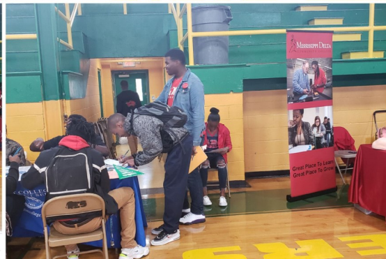
At TEEHS, juniors and seniors had a chance to visit different colleges and university in The Tiger Den.