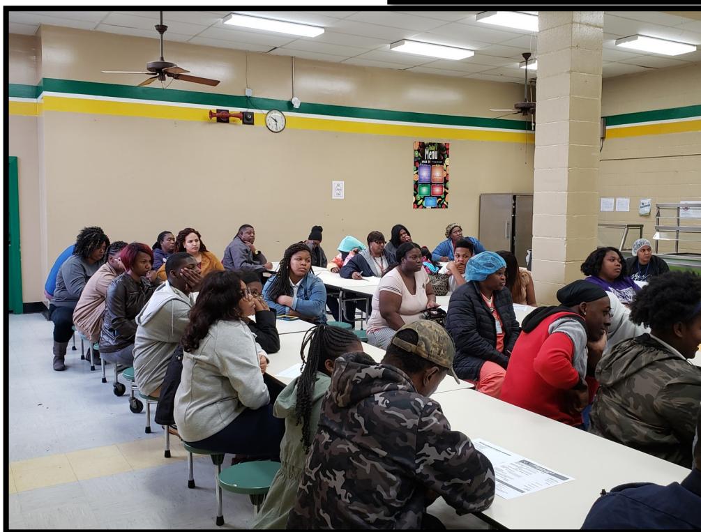
Senior Parent meeting at RCHS. Parents were informed about class night and graduation information.