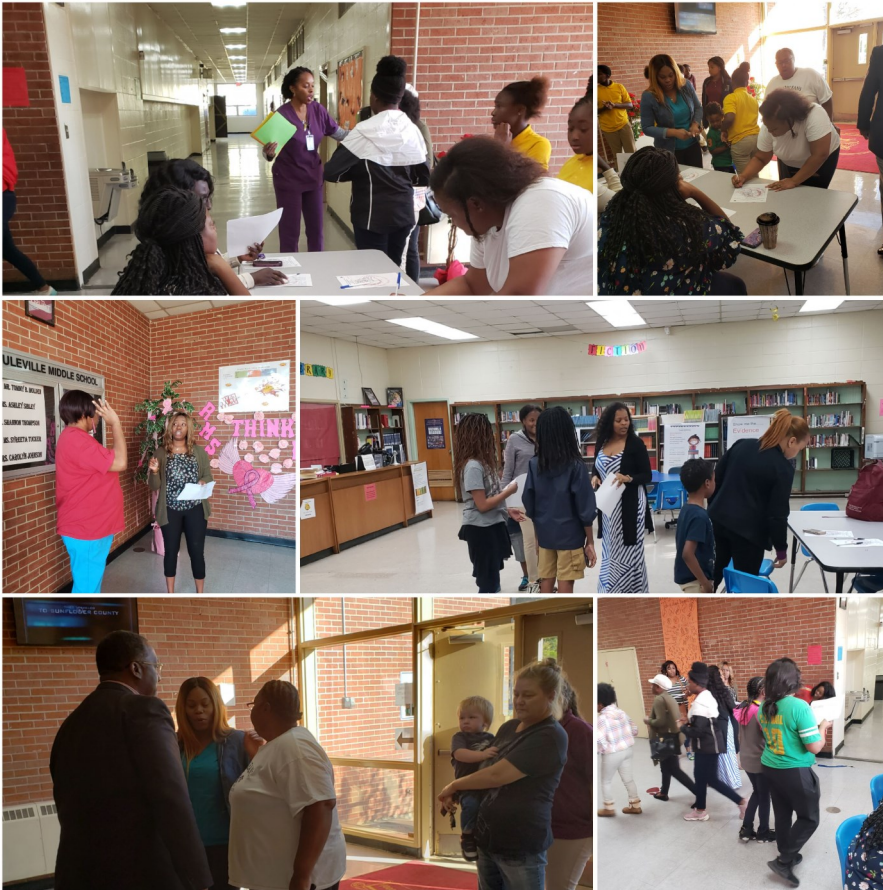
Open House was a success at RMS.