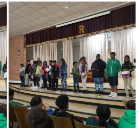
1st Nine-Weeks Award program.