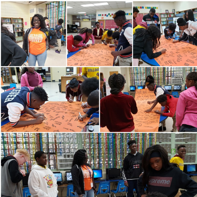
RMS Bulldogs against bullying.