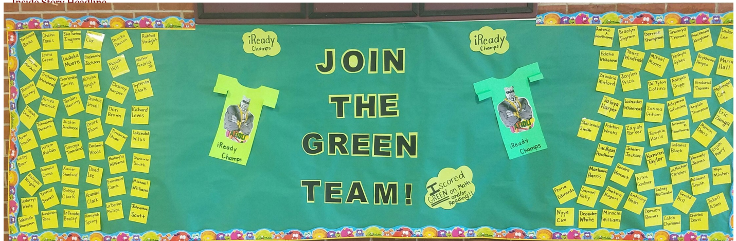
Inside Story: Headline