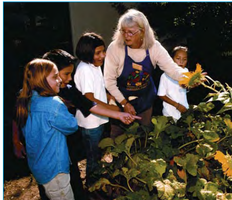
Le Adams, Farm to Table

In recent years, Farm to Table has focused on more "farm to cafeteria" activities, working directly with farmers and farmer groups to increase and develop farm to institution sales and also with food service personnel to facilitate their purchase and use of fresh local fruits and vegetables for both meal and snack programs. They have worked and continue to work on policy changes that improve the way children are eating in school environments. As a small organization, Farm to Table learned early on that partnerships are the key to success. They established the New Mexico Food & Agriculture Policy Council, which includes representatives from a large number of agencies and organizations and establishes yearly priorities for legislation. The Council also provides expert testimony on policy issues related to agriculture, food, and health. In addition to this work, Farm to Table also provides agricultural marketing training for farmers and ranchers. These program areas all include public-private partnerships. Partners in the farm to school program include the NM Department of Agriculture, Marketing Division; school districts that are currently purchasing local foods; the NM Apple Council (a farmer organization); and representatives from several distribution entities.