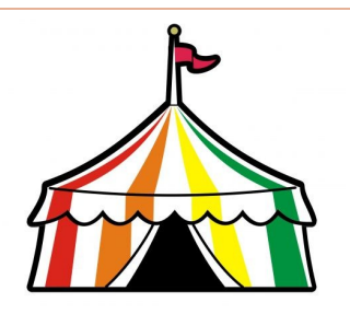
Showing and Growing Our Talents Together!