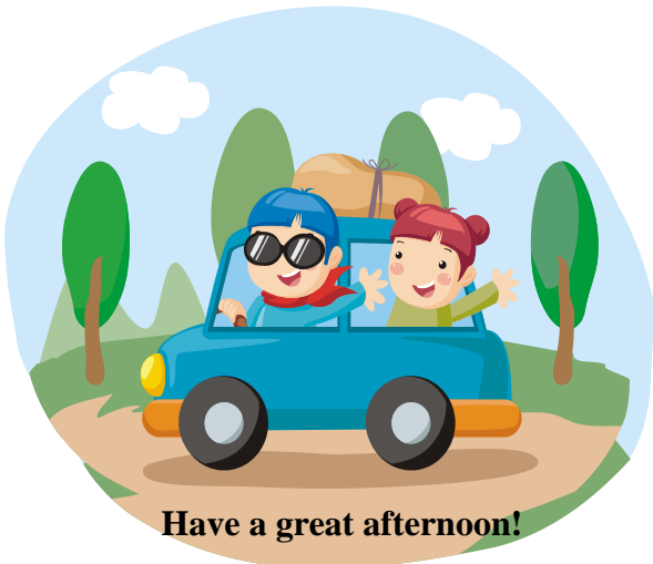
Have a great afternoon!

Walkers: All students that are walkers will be dismissed around 3:15 pm and should be picked up from the right side entrance.