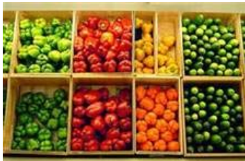
Families can visit a local farmer's market to purchase fresh fruits and vegetables.