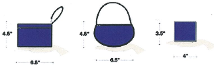
SMALL CLUTCH BAG APPROXIMATELY THE SIZE OF A HAND WITH OR WITHOUT A HANDLE OR STRAP NO LARGER THAN 4.5" X 6.5".