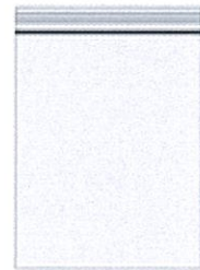
PLASTIC STORAGE BAG 1 GALLON RE-SEALABLE, CLEAR