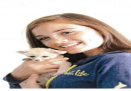
Baby Fennec Fox $10.00