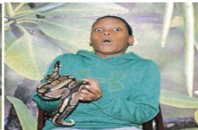
Ball Python $10.00