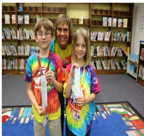
Honorable Mention K-2 Communication and Collaboration

Achievement, Respect and Integrity Through Education