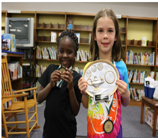
1st Place K-2 Critical Thinking Decision Making and Problem Solving