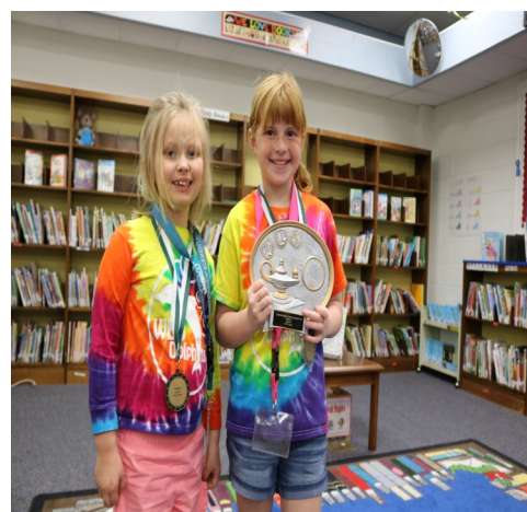
1st Place K-2 Educator/Check It Out (Or In)

WES was well represented at the annual GCSd Tech Fair! Students attending the Tech Fair shared their expertise and knowledge by presenting technology projects to judges. Students from all of the schools in Georgetown County competed in the GCSd Tech Fair which included approximately 200 projects.