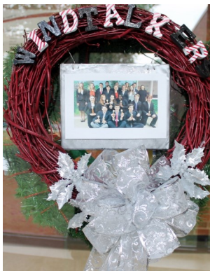
Speech & Debate

This year, the WHS Student Council asked each club, sport, and organization to decorate an artificial wreath to represent their group. Many groups opted to participate, and helped fill the atrium with Christmas spirit. The wreaths are currently on display. Thanks to all of the clubs and organizations who contributed!