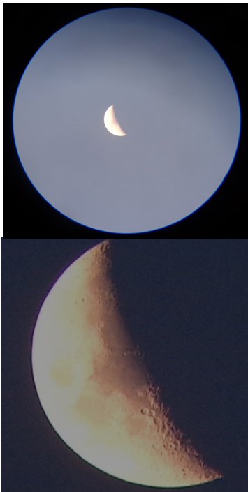
Same picture as above, but zoomed in so you can see the craters.