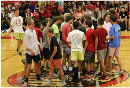
Boys Cross Country