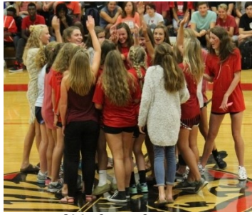
Girls Cross Country