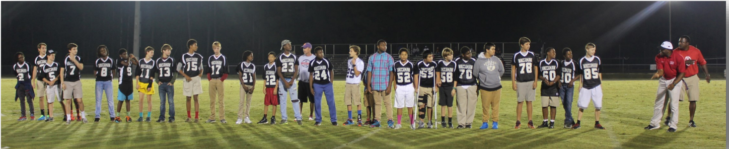
Article by Lyric Wigfall, Vick picture courtesy of South Strand News