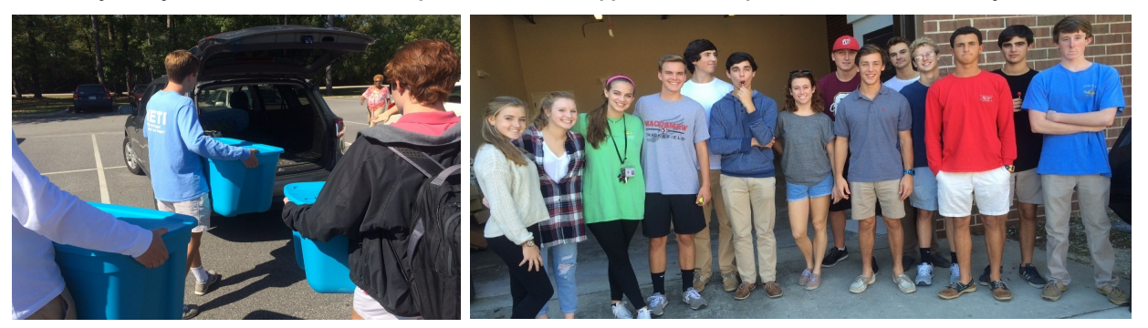
Bins are placed in the cars and the crew on the right unloads the items at Tidelands Company warehouse.