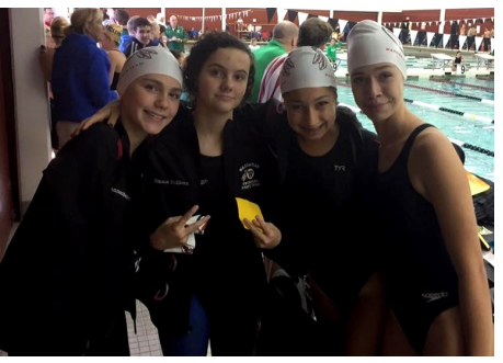
Girls Relay Team