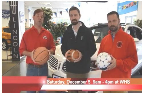
Saturday, December 5 9am - 4pm at WHS

No sales pressure, just a smooth test drive of a new Lincoln and $20 to the team of your choice. The team that has the most drivers will also receive an additional $250 from the Booster Club. Let's surpass last year's donations of $6,000. Support your Warriors!