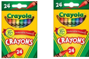
2 CRAYOLA 24 count crayons