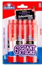
2 packs of large Elmer's glue sticks