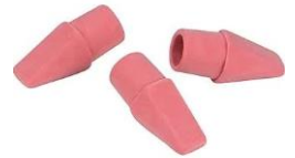
Pencil top erasers