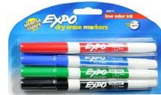
1 pk large dry erase markers