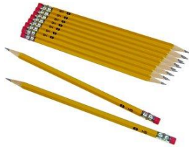
#2 yellow pencils