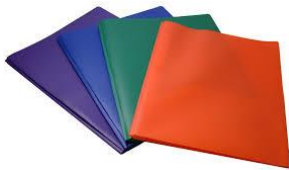
2 folders (With pockets)