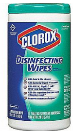
2 Clorox wipes