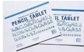
2 writing tablets