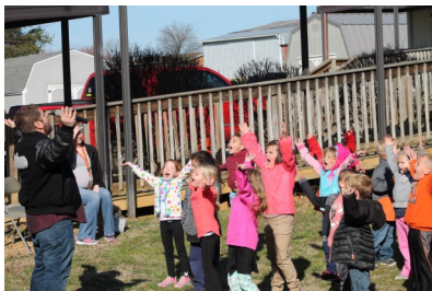
Boys and Girls Club read to our school