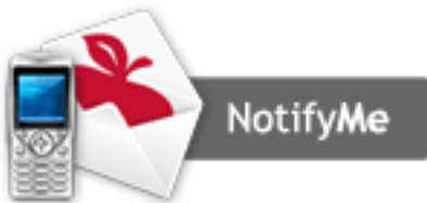
Example of a NotifyMe Icon

School subscribers will automatically receive all district messages. However, if you wish to receive district-wide messages concerning inclement weather and the Extended School Program but no information associated with an individual school, you may subscribe from the district web site.