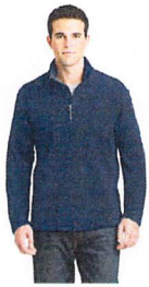
This is what the fleece looks like.

Navy AXS _____ AS _____ AM _____ AL _____ AXL _____ AXXL _____