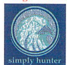
Design 1 Back