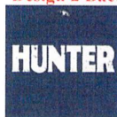
Design 2 Back