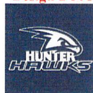
Design 2 Front