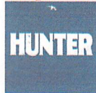
Design 1 Back