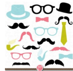
Photo Selfie Booth