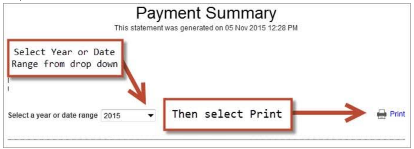
Step 5: Select the year you need & then 'Print'.

If you have any questions, please call FACTS at 866-441-4637.