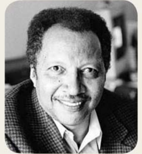
Walter Dean Myers born 1937

Walter Dean Myers was born to a large family in West Virginia. After his mother died when he was two years old, his father could no longer care for all the children. Myers grew up with foster parents in New York City. A speech impediment made it difficult for