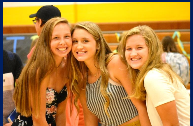
Students happily pose at the RCHS P.R.I.D.E. club selection event.