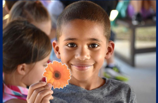
2 nd grade RCES student showing off a sticker he earned after completing a butterfly lesson in the newly renovated outdoor courtyard learning space.