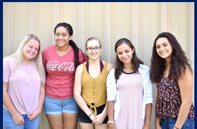
RCHS Teachers for Tomorrow students pose for the camera before starting in the RCES classrooms.