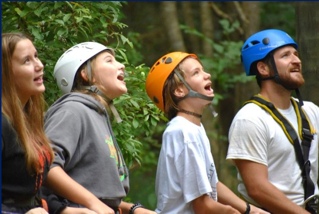
8 th grade students, shown with adventure guide, complete team building exercises during the annual trip to Verdun Adventure Bound. See page 2 for more details.