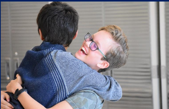
Students celebrate a successful team building exercise in the STEAM lab. See page 2 for details.