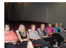
Appling County Systemwide meeting 2010-2011