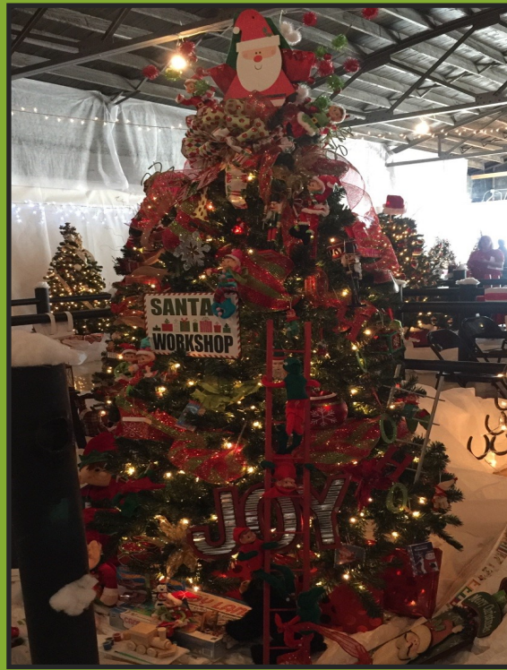
Hopkinsville Middle School

You are invited to celebrate Freedom's Scholars at the 2nd Annual Leadership Event