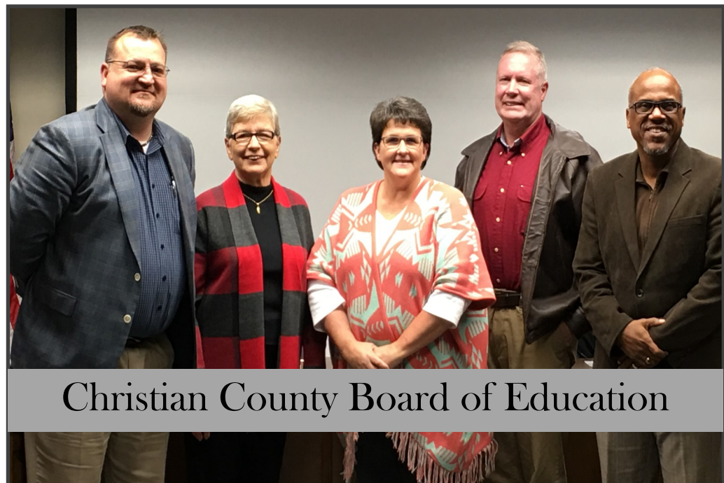
Christian County Board of Education