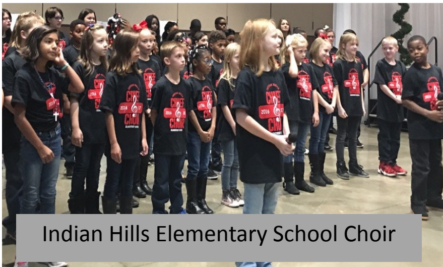
Indian Hills Elementary School Choir