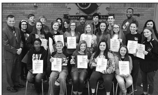
Hopkinsville Middle School Mayor’s Scholars