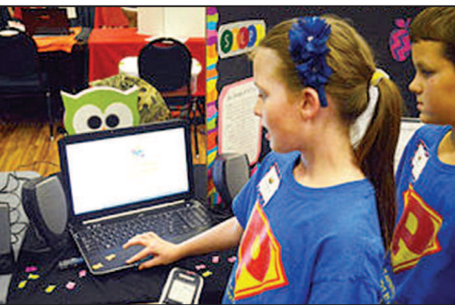
Students compete at the STLP regional showcase