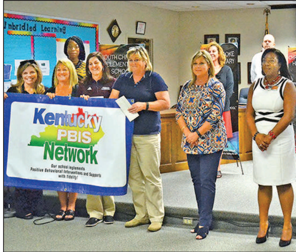
Principals are honored at a board meeting for K-PREP scores and implementation of Positive Behavior Interventions and Supports.