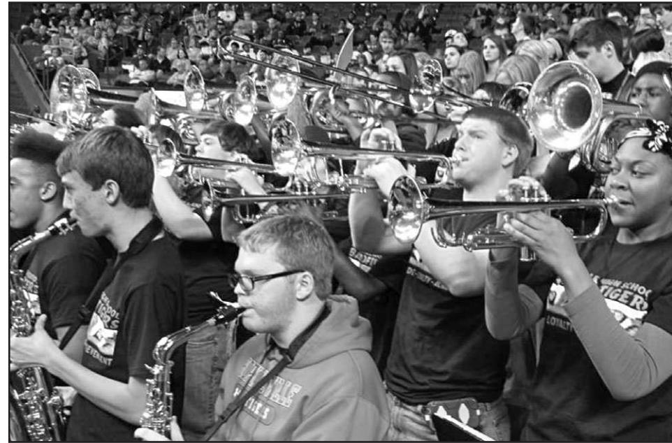
Hopkinsville High School Band