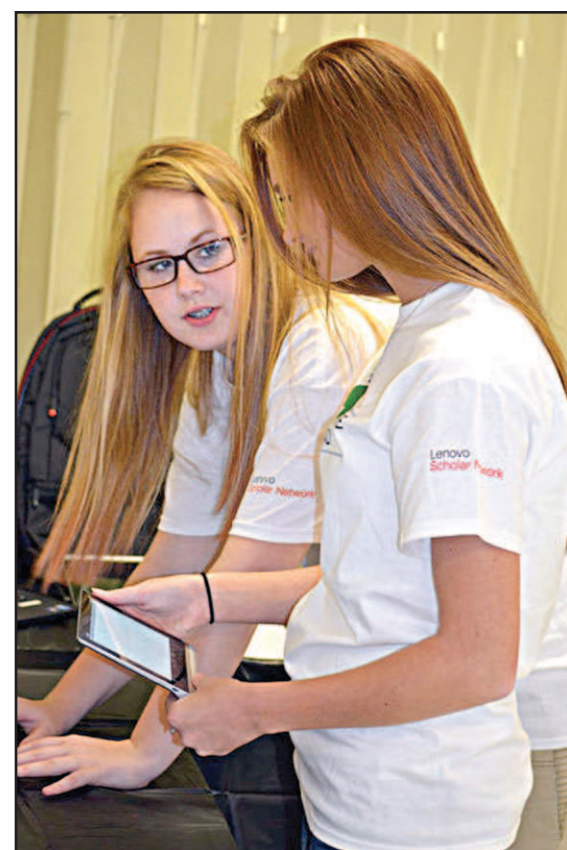
Gateway Academy students making mobile apps