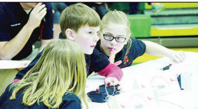
Millbrooke Elementary's Quick Recall Team