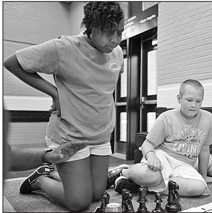
Students engage in the game of chess at Freedom Elementary School.