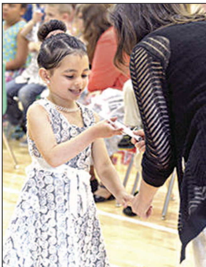
Kindergarten graduation at Pembroke Elementary