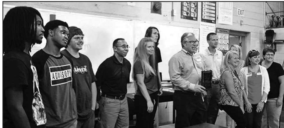
White Drive Products partners with Gateway Academy with a donation of nearly $180,000 worth of equipment

Community support, involvement and partnerships are key components to continuous academic progress and achievements.