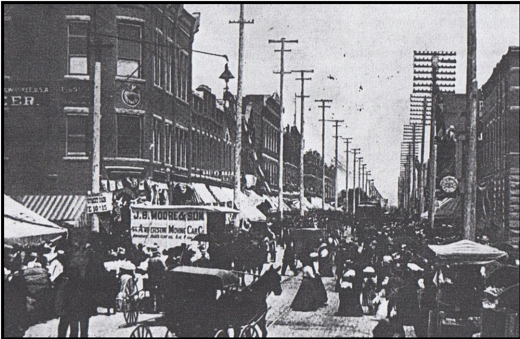
Downtown Alexandria circa 1909