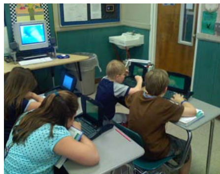
Students use eMates purchased from an eBay auction.

More Pictures from Brian's Classroom: http://gallery.mac.com/brian.tisdale