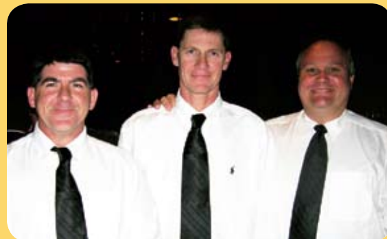
The Alabama Southern Foundation hosted a Black Tie & Blue Jeans fundraiser to increase community support and funds for scholarships.