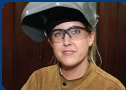
Welding offers many career opportunities nationwide.