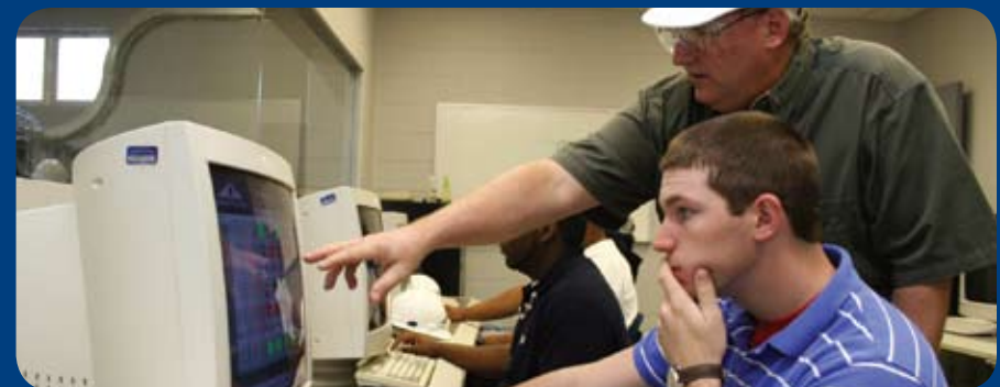
Technology labs on the Thomasville campus offer hands-on training that prepares students to work in area industries.