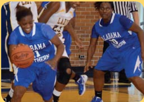
Lady Eagles Basketball

■ Alabama Southern's men's basketball team also had a successful season, finishing 23-9 overall and a 14-2 record in conference play. The team won the ACCC's Southern Division title for the third straight year and led the conference in scoring with 79.4 points per game.