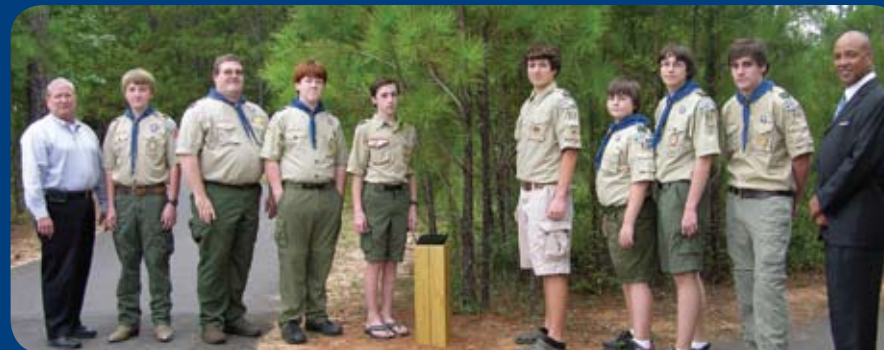
Local scouts participated in the Dedication Ceremony for the new Nature Trail in Monroeville.