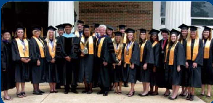
Alabama Southern's Phi Theta Kappa graduates honored at 2011 graduation ceremony

The Alabama College System's All-Alabama Academic Team is an enhancement to the All-USA National Academic Team Recognition Program, which is sponsored by Phi Theta Kappa Honor Society, USA Today and the American Association of Community Colleges.