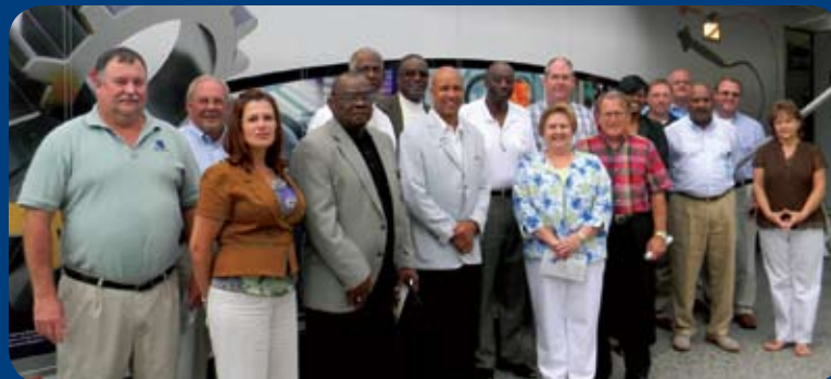
The Southwest Alabama Industrial Engineering Consortium opened a new training unit in Jackson.