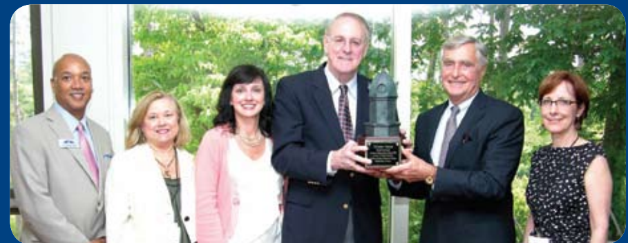
Alabama author Winston Groom accepting the 2011 Harper Lee Award for Alabama's Distinguished Writer.