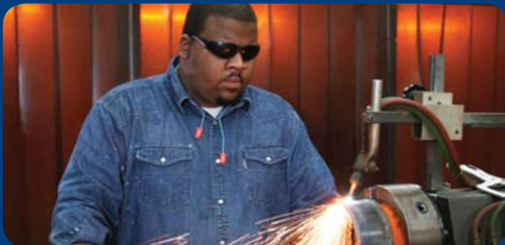
Our welding program helped Thomasville land Lakeside Steel's new manufacturing site.