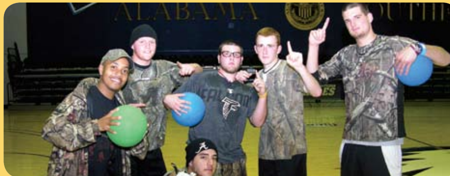
Dodgeball in Monroeville