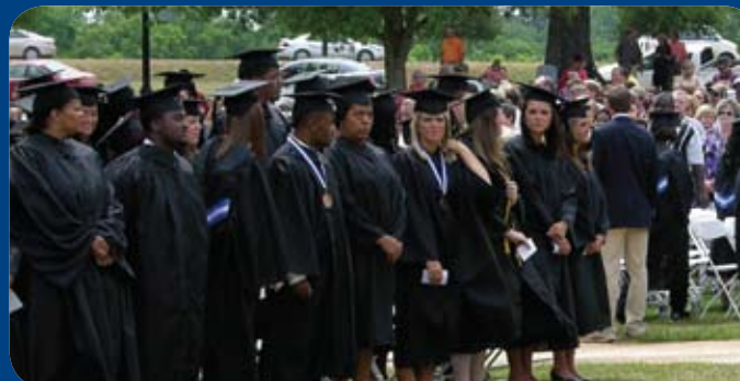
In 2011 Alabama Southern held its first outdoor graduation on the Monroeville campus.