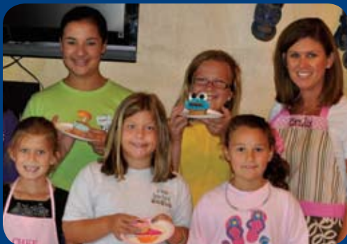
Kids College cupcake classes were a big success!