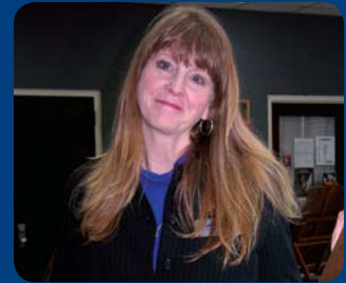
Alma Susan Brown Academic Instructor of the Year Honoree Art instructor on the ASCC Monroeville Campus