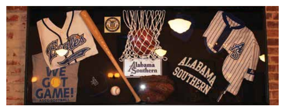
In August, President Sykes, ASCC coaches, faculty and staff, gathered at The Prop and Gavel, a locally-owned restaurant located in historic downtown Monroeville, to unveil a framed shadow box of Alabama Southern sports memorabilia.