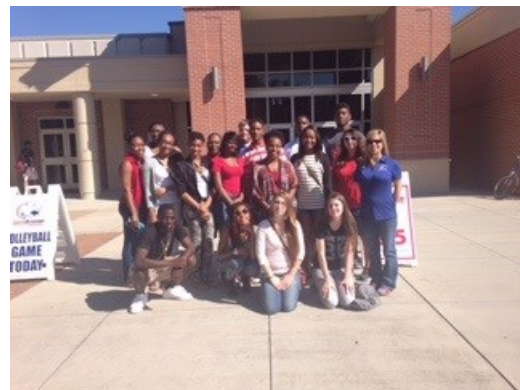
University of South Alabama