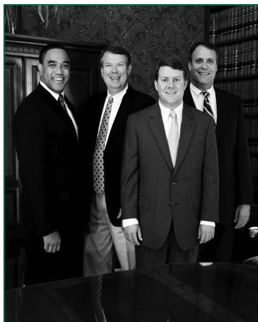
Leaders in car accident claims and litigation

M&W continues to rely on "word of mouth advertising" for new claims and cases. We are proud that almost 97% of our new clients are recommended to our firm by former clients, area healthcare professionals and/or other lawyers. We are glad to have the opportunity to assist your friends with legal questions, even if those questions are related to areas of law outside our main area of practice. Also, remember that our web site: www.moore-wolfe.com has lots of helpful information for auto-negligence victims.