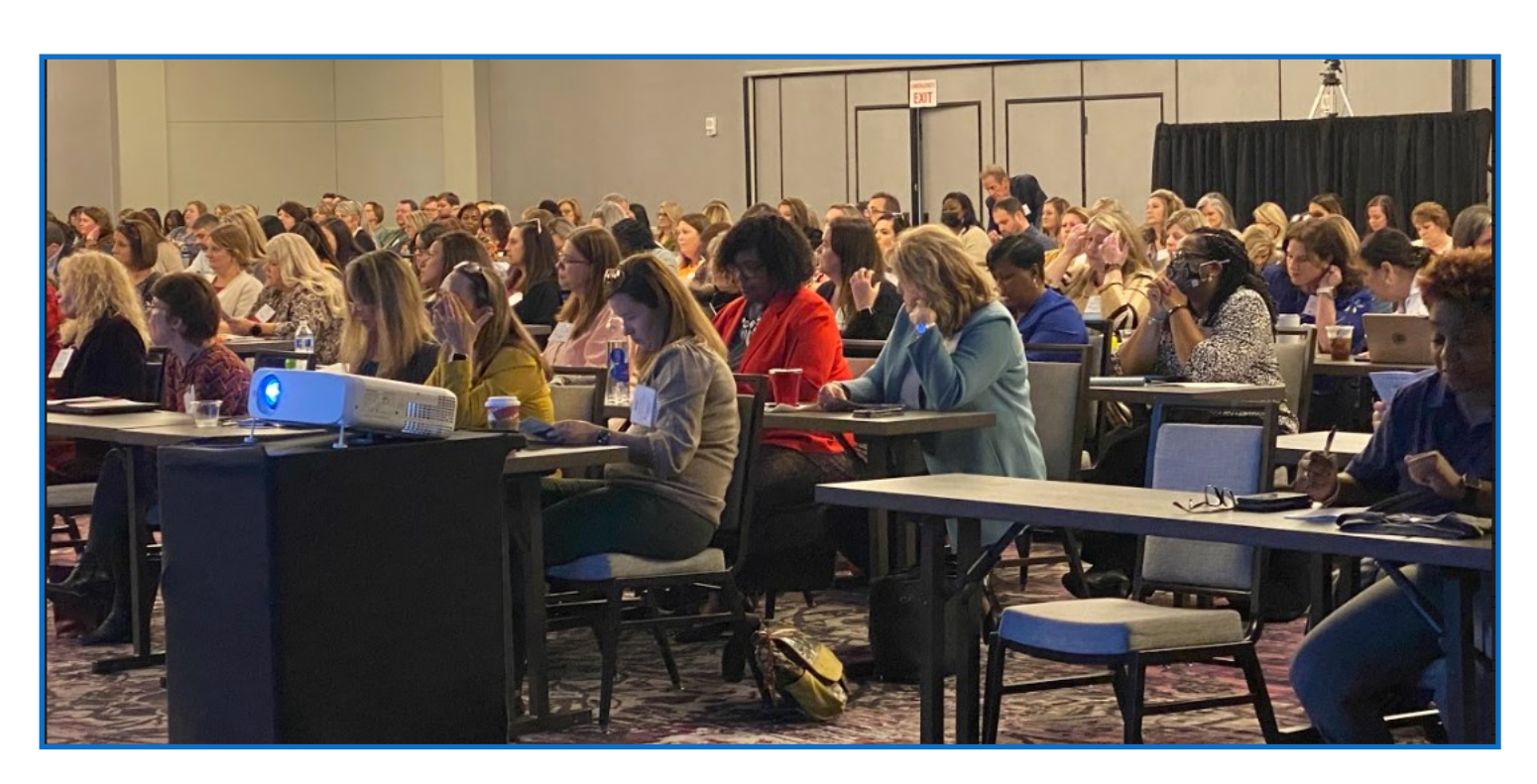
2021 G-CASE Fall Conference The Hyatt Regency, Savannah