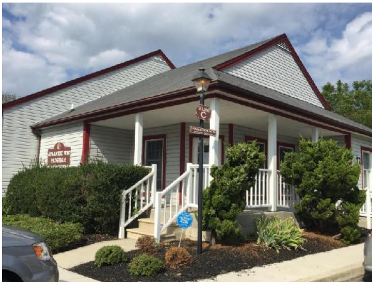
Pleasantville WIC office.

Gateway Community Action Partnership assumed sponsorship of the Atlantic County's Women Infants and Children (WIC) Program in October with expanded hours and new facilities to better serve county residents.