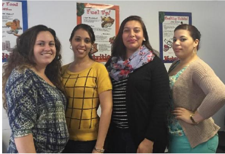
Pleasantville WIC staff.

Hamilton Head Start Children Benefit From Girl Scout's Kindness, Initiative