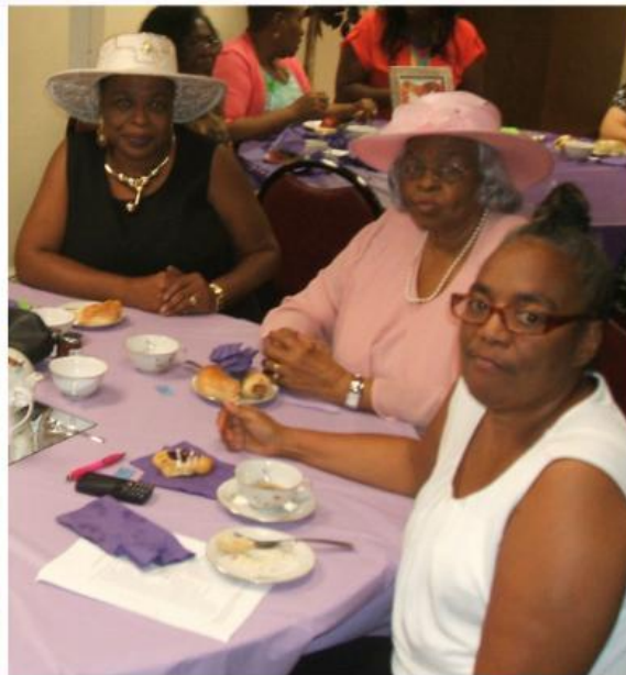
The Salem Family Success Center held a Grandparents & Caretakers Appreciation Tea in September. The event is designed to show appreciation to grandparents and caretakers for their dedication to keeping families together.