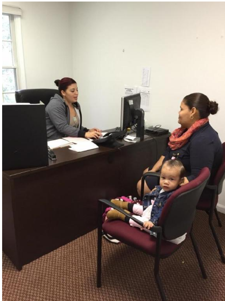
Pleasantville WIC staff member helping a family.

Galloway Office 333 Jimmie Leeds Rd., Unit 5 Galloway, NJ 08205 Hours: TBD