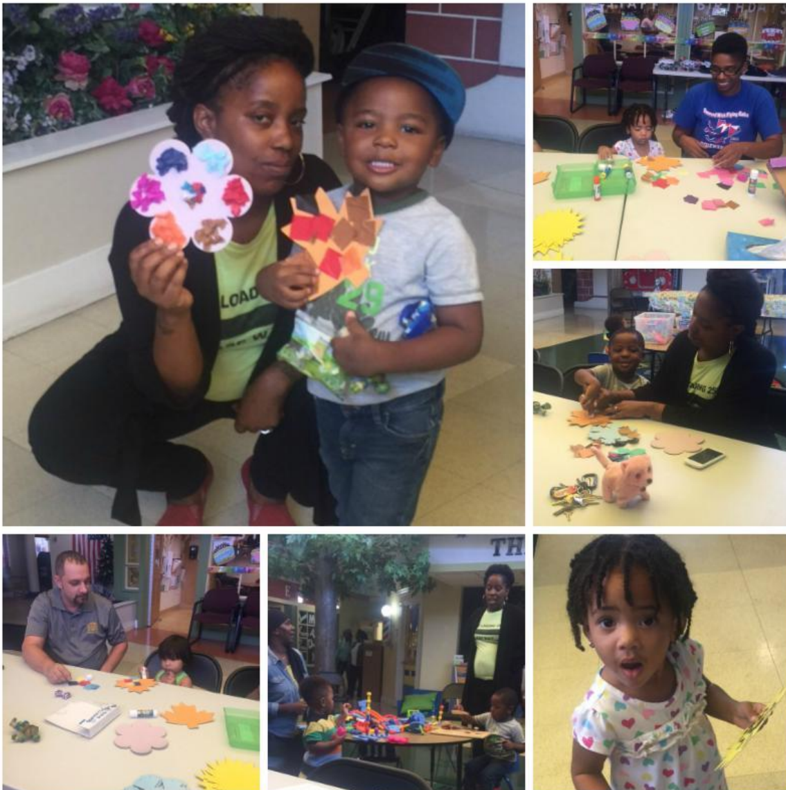
Head Start held a Home Based Socialization in September. The families were given tissue paper and cut out shapes and created seasons on the shapes. The families worked together to complete puzzles and played with legos and blocks.