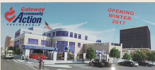
New Head Start Early Education Center is scheduled to open in 2017 near City Hall on Bacharach Avenue in Atlantic City.

pointed to an artist's rendering of the center. "A beautiful spanking brand new Head Start center situated right here in the heart of Atlantic City. We have to plant the seeds today for their greatness tomorrow, and this is one way to do it. We are going to do what we have to do to provide greatness for our children to move ahead. Our children deserve nothing less than our best. Not just our good intentions, not just our good attempt, not just some good idea. Our children deserve greatness. From this tragedy will be transformation and great triumph."