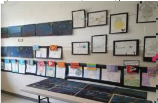
Day of the Arts 2017

Students at Whitesburg Elementary transformed their hallways into art galleries for families and visitors to enjoy.