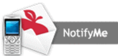
Example of a NotifyMe Icon

School subscribers will automatically receive all district messages. However, if you wish to receive district-wide messages concerning inclement weather and the Extended School Program but no information associated with an individual school, you may subscribe from the district web site.