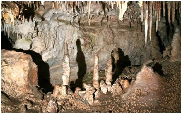
Stalactites and Stalagmites in Lehman Caves