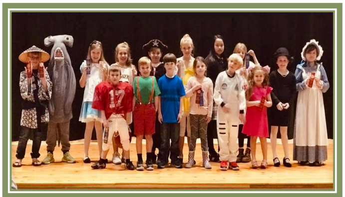
Manchester Academy students participate in the District Reading Fair.

In other news, March 1 is Read Across America Day - Dr. Seuss. Read your newsletters for activities planned for this week. We will begin taking our achievement tests when we return from spring break. Students will need to get plenty of sleep and eat breakfast each day so they can all do their very best on the tests. Thanks for sharing your precious children with us!