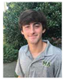
By: Matt Carroll