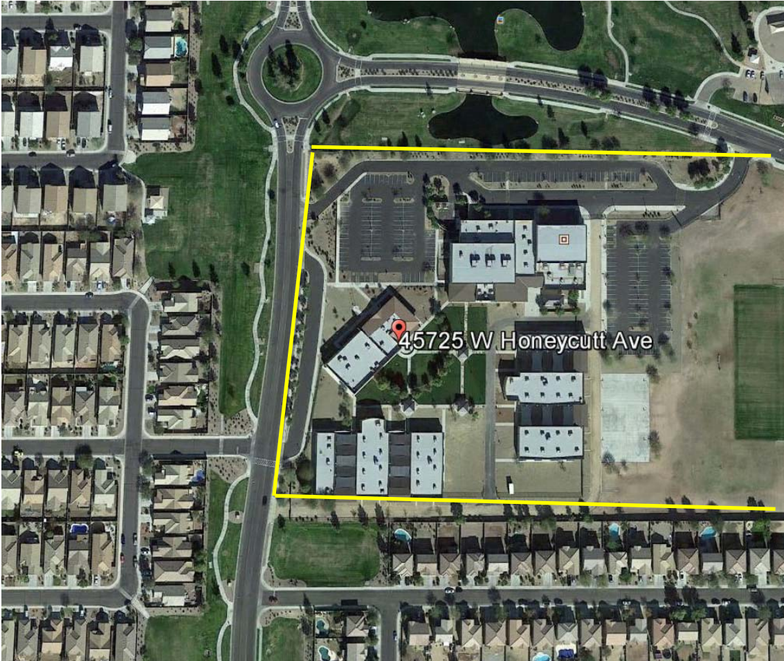
DIAGRAM NOT TO SCALE

Maricopa Wells Middle School 45725 West Honeycutt Road Maricopa, Arizona