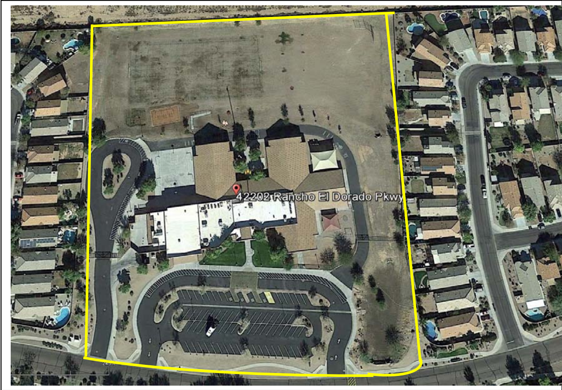
DIAGRAM NOT TO SCALE

Pima Butte Elementary School 42202 West Rancho El Dorado Parkway Maricopa, Arizona