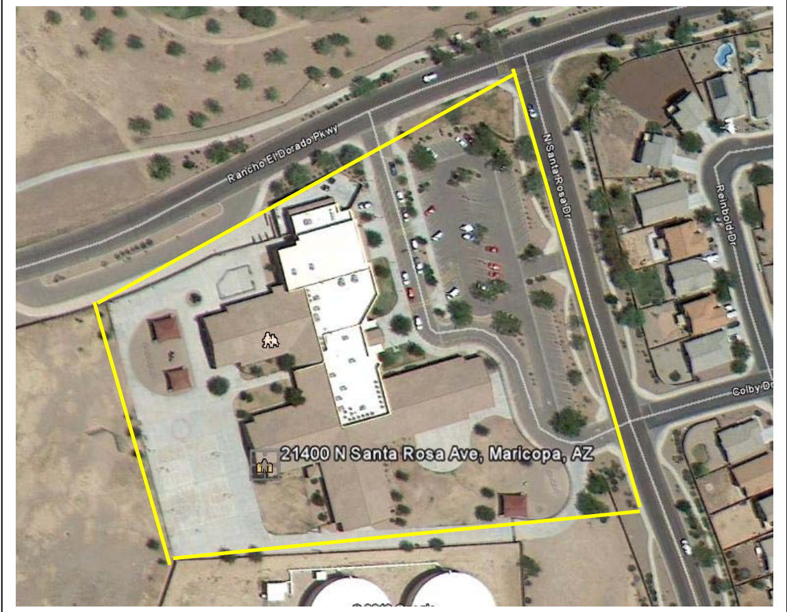
DIAGRAM NOT TO SCALE

Santa Rosa Elementary School 21400 North Santa Rosa Drive Maricopa, Arizona