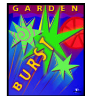
Assorted Grab-and-Go Salads served with a Roll