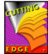
Assorted Grab-and-Go Sandwiches