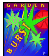
Assorted Grab-and-Go Salads served with a Roll